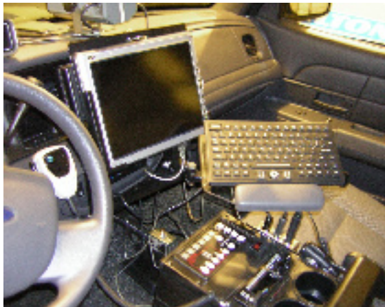
Photo of typical M777 installation in a police cruiser.

The design minimizes grooves where dust or other elements may accumulate, making it simple to wipe down for cleaning. This new design helps preserve a "clean room" environment.